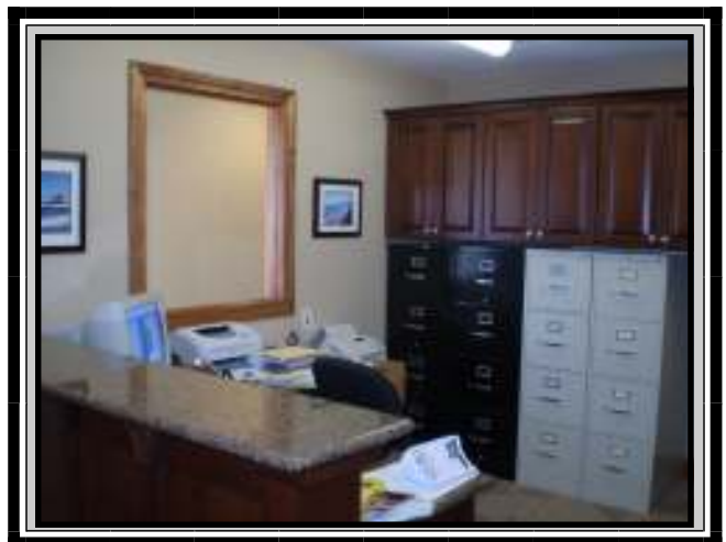
Reception area inside the Five Rivers Office