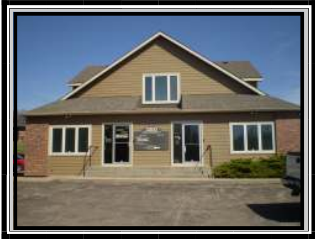
Front of building, our entrance is on the east side

We've Moved to Lawrence 3300 Clinton Parkway Court Suite 110 Lawrence, KS 66047-2629 Phone: 785-841-4804