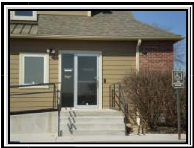
East entrance, office is directly inside the door