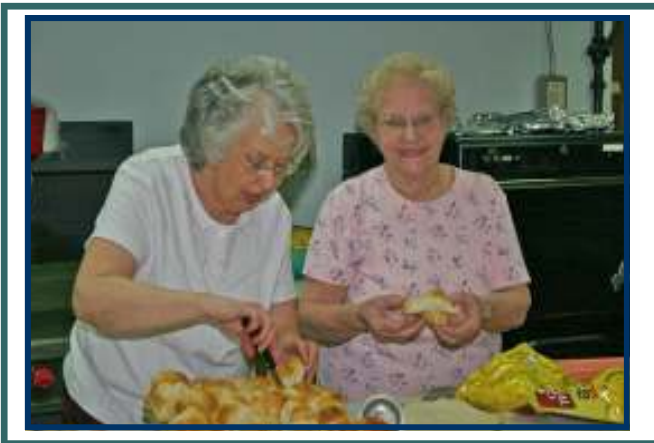
Garnett Church UMW Provided our lunch