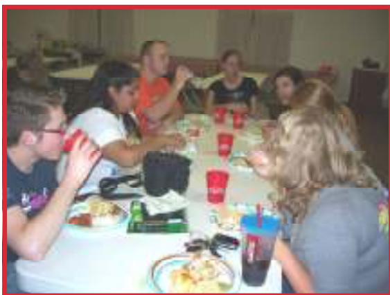
Sunday Night Live meal-