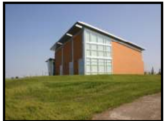
Lawrence 1st West Campus Facility. The massive windows have a large, light blocking blind that adds to the functionality of the spacious multi purpose center.