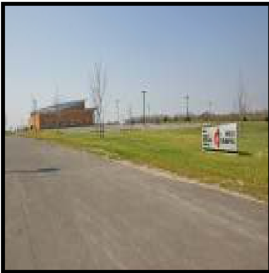
West Campus View from 10 HWY