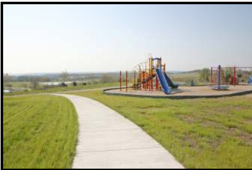
Lawrence 1st UMC playground overlooking the 2/3 mile walking trail